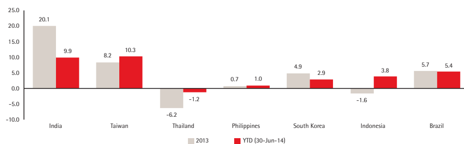
Chart 1: Net equity flows (US$bn)

Most Emerging Markets also recorded a good performance, driven by global liquidity and easing concerns of a sudden withdrawal of quantitative easing measures by the US Federal Reserve. India however stood out, not just outperforming most markets, but also attracting a disproportionate share of global fund flows.